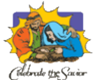
Celebrate the Savior